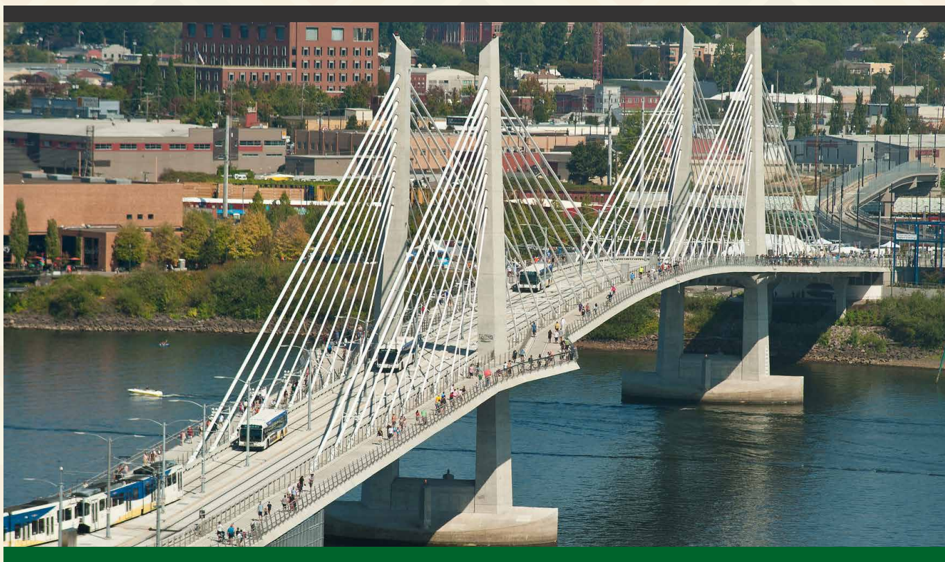
Tilikum Crossing - Bridge of the People Tilikum is Chinuk Wawa (word) for “people” or “family”